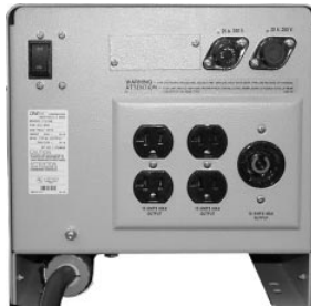
CC Series Back Panel