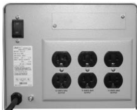
CB Series Back Panel

All CB/CC Series models are UL, cUL approved. **